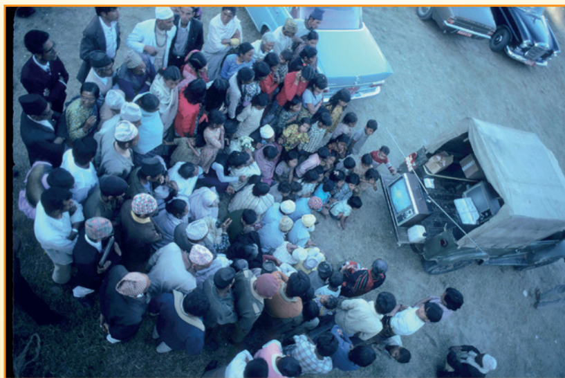
Maharishi brought 500 television sets to Nepal

I n a time when television was almost unknown in Nepal, Maharishi brought 500 television sets and set up a temporary tower in the famous Swayambhu Buddhist Temple situated on a high point in